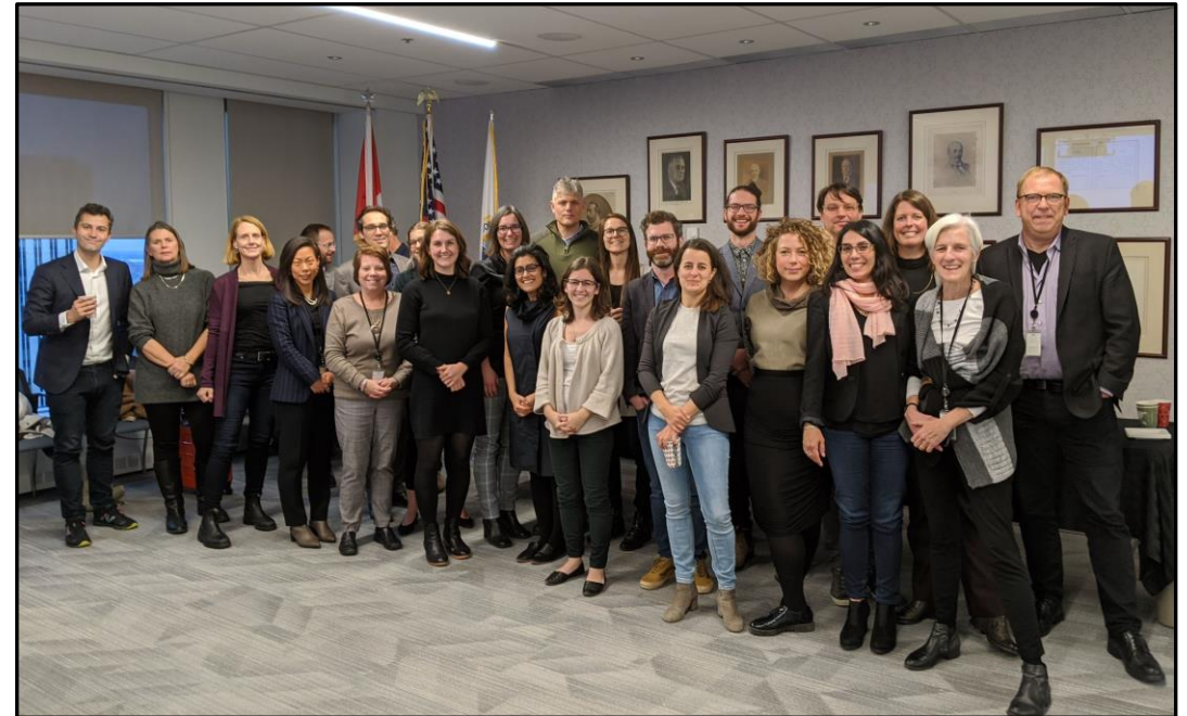
Low Carbon Funders Group in Ottawa, November 2019