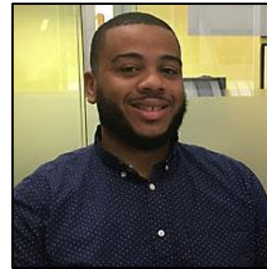
Redmond Chambers Membership Services and Operations Manager Started October 2019